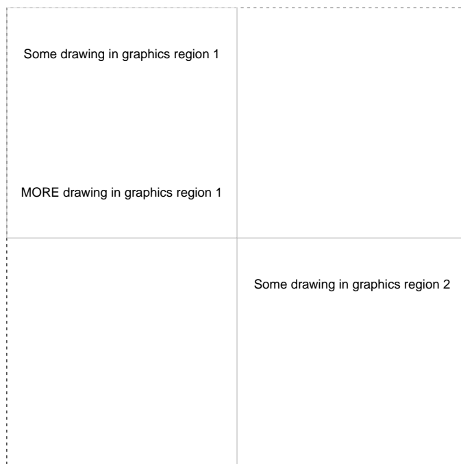
Figure 2: Defining and drawing in multiple graphics regions.